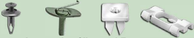
Automotive Clips and Fasteners

Here is a sampling of the over 18,000 items that can be found in our 700+ page catalog. To view our on-line catalog, visit our web site at www.auveco.com .