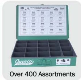
Over 400 Assortments