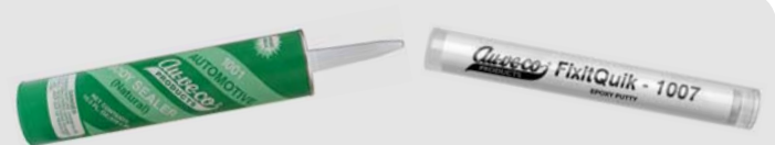
Sealers & Epoxy