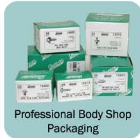
Professional Body Shop Packaging