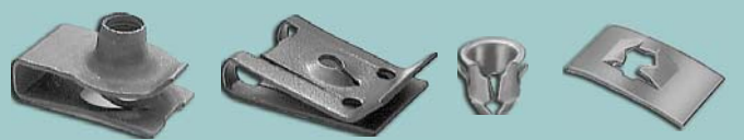
Flat, Tubular, "J", "U" & Extruded "U" Nuts