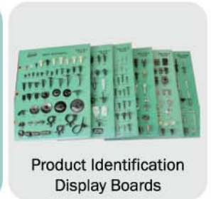
Product Identification Display Boards

Since 1916 Auveco (Auto Vehicle Parts Co.) has been manufacturing and distributing specialty automotive and industrial fasteners. With programs like Body Hardware Master and the trilingual AuvecoPak retail package as well as technology based solutions such as our FasTrack Cost Recovery software and e-commerce web site (auveco.com.) , Auveco is the world's leader in servicing our customer's needs for body hardware and specialty fasteners through our network of Distributors around the world.