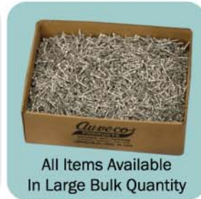
All Items Available In Large Bulk Quantity