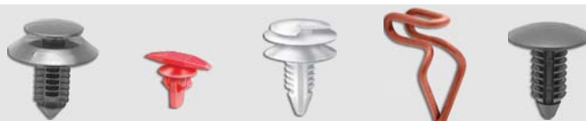
X-Mas Tree Retainers